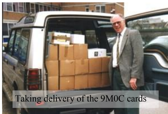
Taking delivery of the 9M0C cards