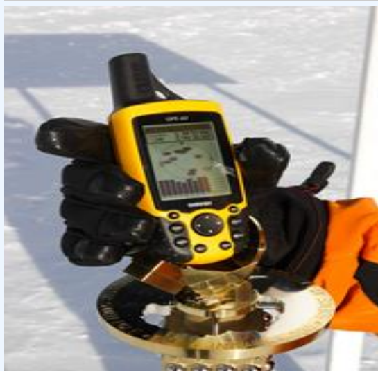
GPS receiver on the South Pole