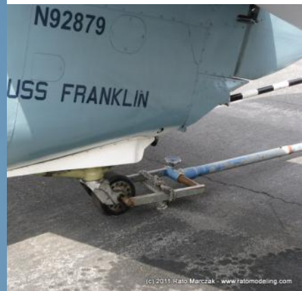
Shot of Last flying Curtiss SB2C Helldiver's tail wheel

Thanks Mike - a really interesting story ; can anyone else match that ??