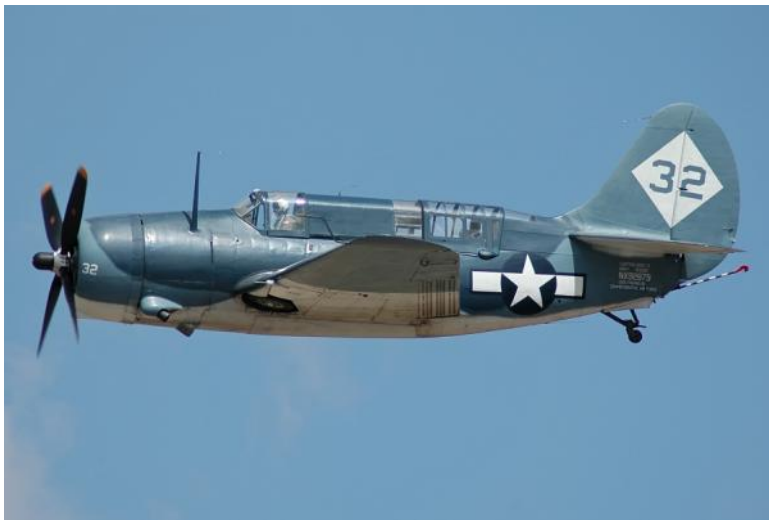
Curtiss SB2C Helldiver in action