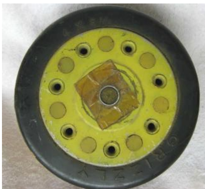
Profile View of SB2C tail-wheel