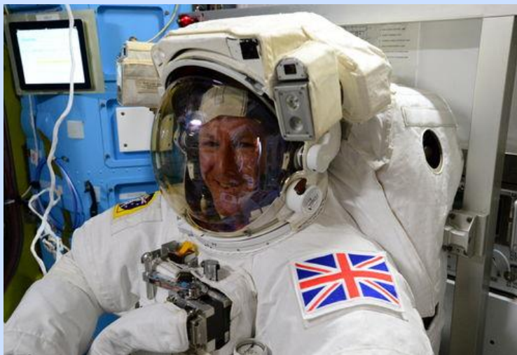
Tim Peake prior to his space walk

The school will be running a whole series of space related events ahead of the ISS link-up. SARC will be assisting by running a Special Event Station using the club callsign and a Buildathon event on Friday 5th February at the school. The aim of the Buildathon is to encourage the pupils to build their own radio receiver under the watchful eye of members from the club. The kits have been kindly donated by the RSGB and are for the "Rodway" receiver which is designed to work on the MW and 160m band, which should allow both easy reception of local broadcast stations and short range "Top Band" AM signals.