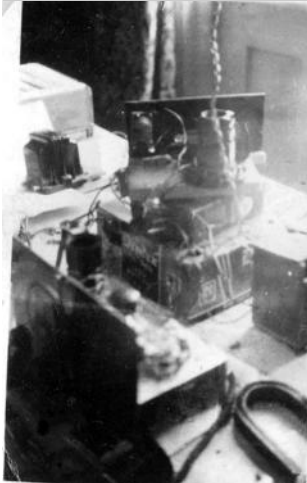
The early RX circa 1950—The RF stage is sitting on the 120V battery