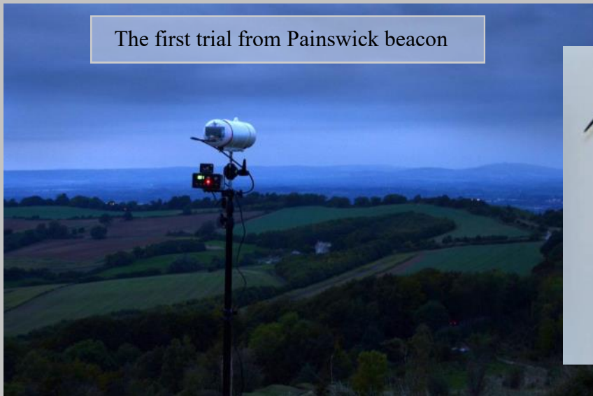
The first trial from Painswick beacon

Chris’s talk will explore optical communications and amateur optical transmitter/receiver design and then describe the results of a very wet evening’s attempt to link Painswick Beacon to Mayhill on the Hereford/Gloucestershire border.