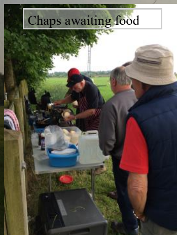
Chaps awaiting food