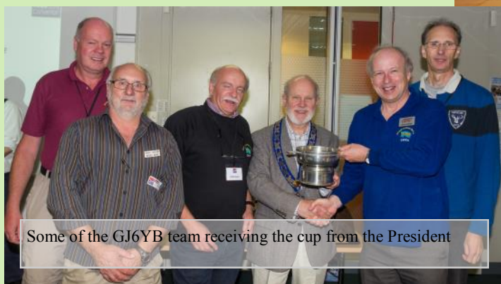
Some of the GJ6YB team receiving the cup from the President