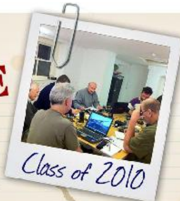
Class of 2010

No matter your experience, why not attend our morse code training course. Each week we will take you through letters of the alphabet using tried and tested methods, show you on air etiquette, and make the learning experience both fun and informative.